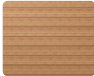
Wood Grain Finish